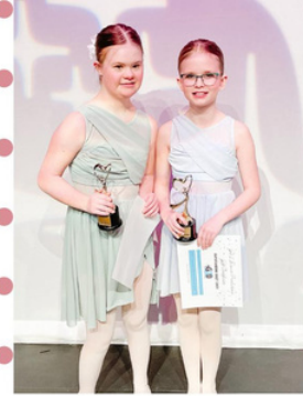
Cyot 2 Dance